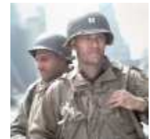
“Saving Private Ryan”